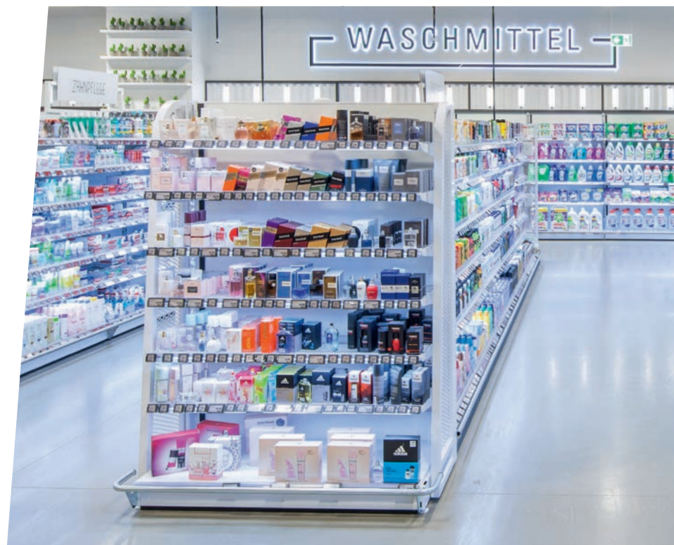
↑ FROM GONDOLA ENDS to complete shelving units: Wanzl Shopping Solutions set the benchmark in product presentation.