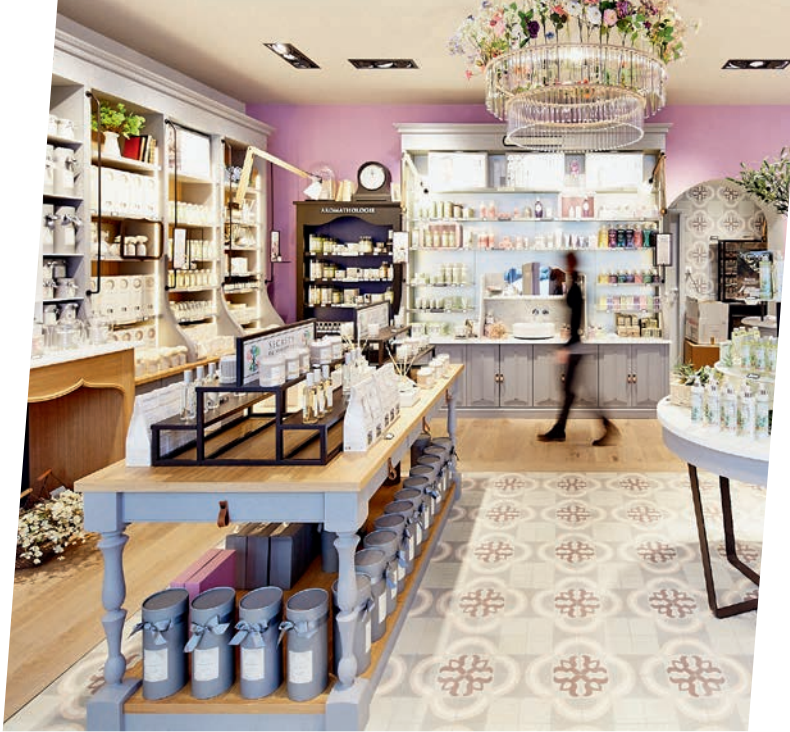
↔ “DURANCE” IN PARIS: The dream of your own beauty salon living room has come true!