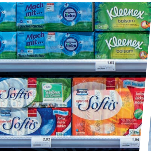
↑ → SHELVING SYSTEMS THAT CAN BE OPTIMALLY ADAPTED TO THE PRODUCTS ensure the best possible utilisation of existing space.

With design expertise and a wide range of shopfitting elements, Wanzl Shopping Solutions offer all the elements needed to combine this expertise in an all-round solution. Based on individual design concepts integrated into the overall store, we can set up our modular and adaptable presentation and shelving systems to perfectly suit the conditions on site and provide your customers with fast, unhindered access to your product range.