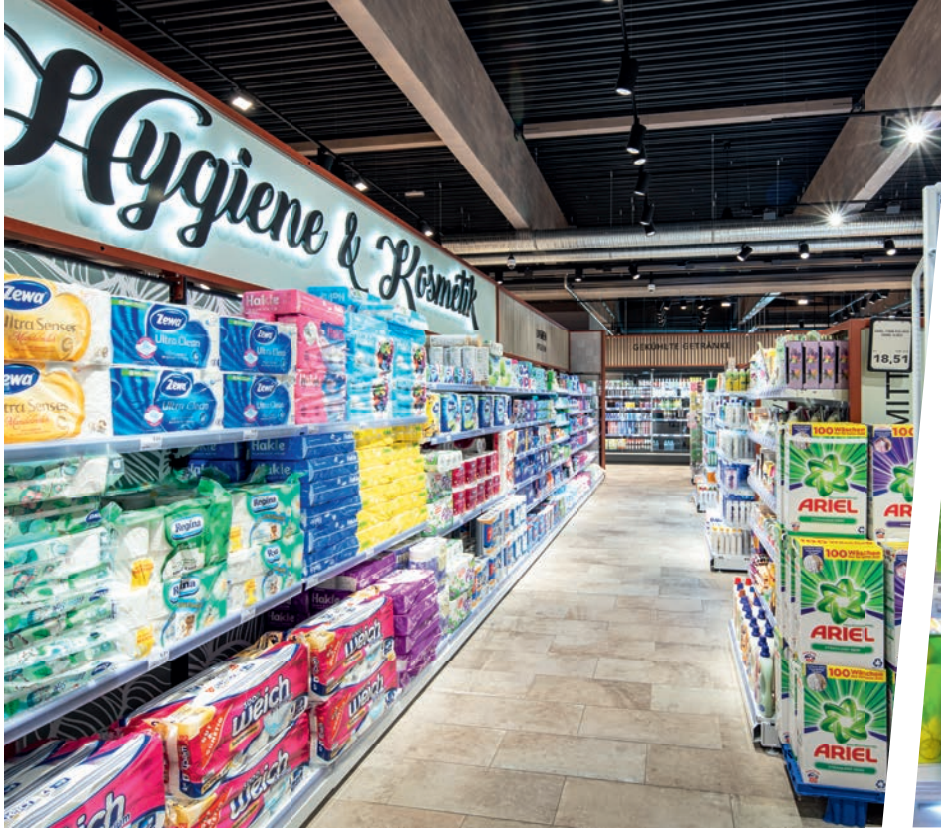
↑ WANZL SHELVING SYSTEMS also create sufficient space for extensive product ranges.