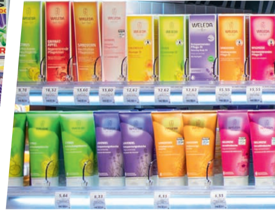
↓ PRICING – made easy: This aspect of the system is perfect right down to the last detail.